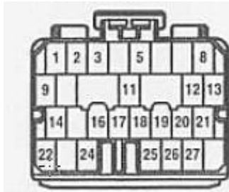
A 28 PIN